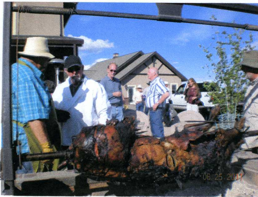
RIP little piggy!